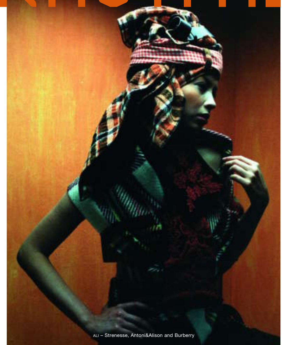
ALI - Strenesse, Antoni&Alison and Burberry

Ancient Roots: Worn by Sikhs, Muslims, and Rastafarians alike the turban is the cultural thread that runs from east to west and back again.